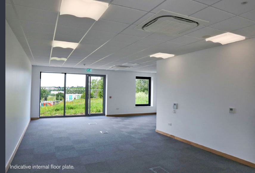
Indicative internal floor plate.

19 car parking spaces are provided in adjacent parking groves.