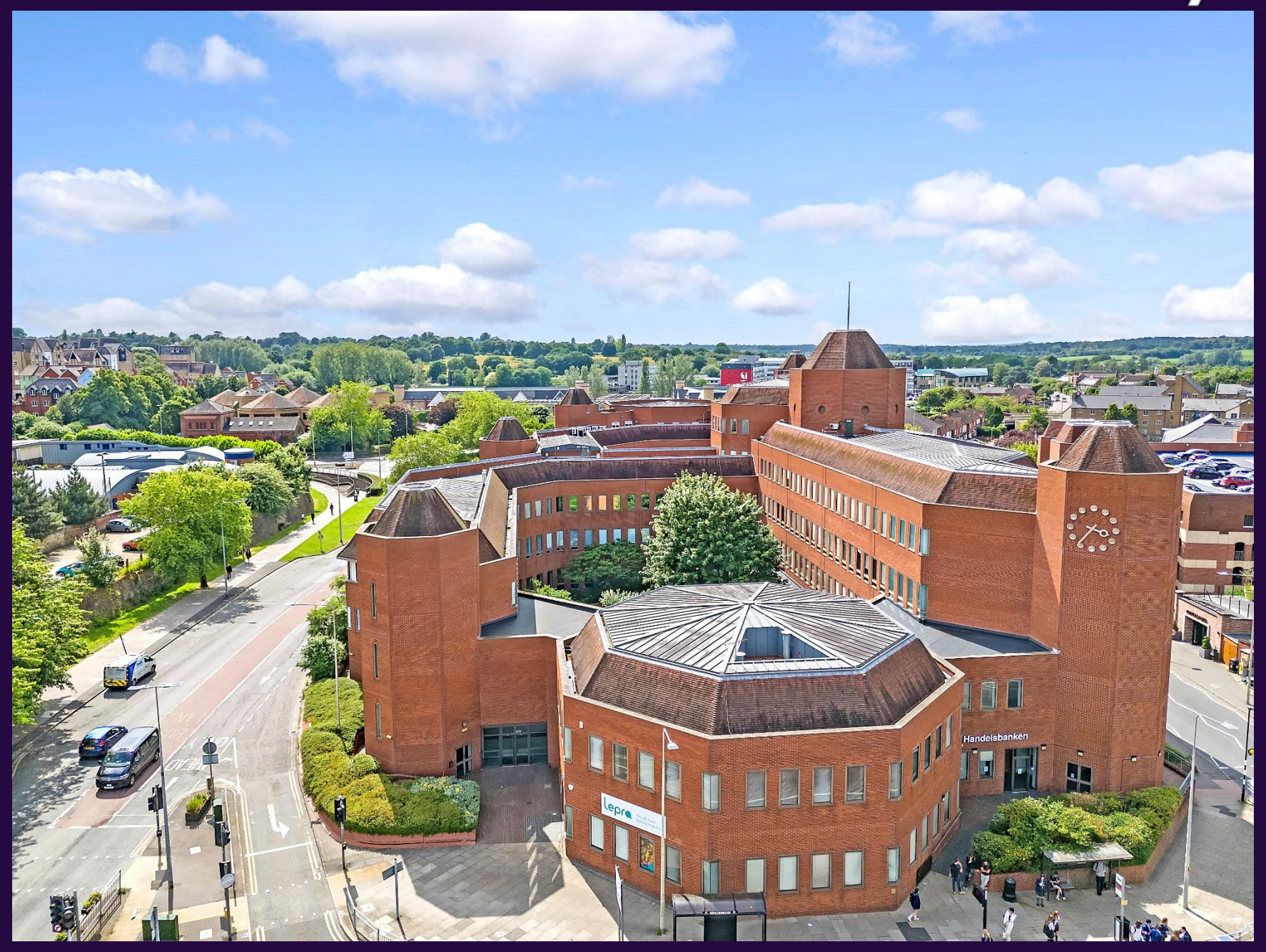
28 Middleborough, Colchester, Essex, CO1 1TG