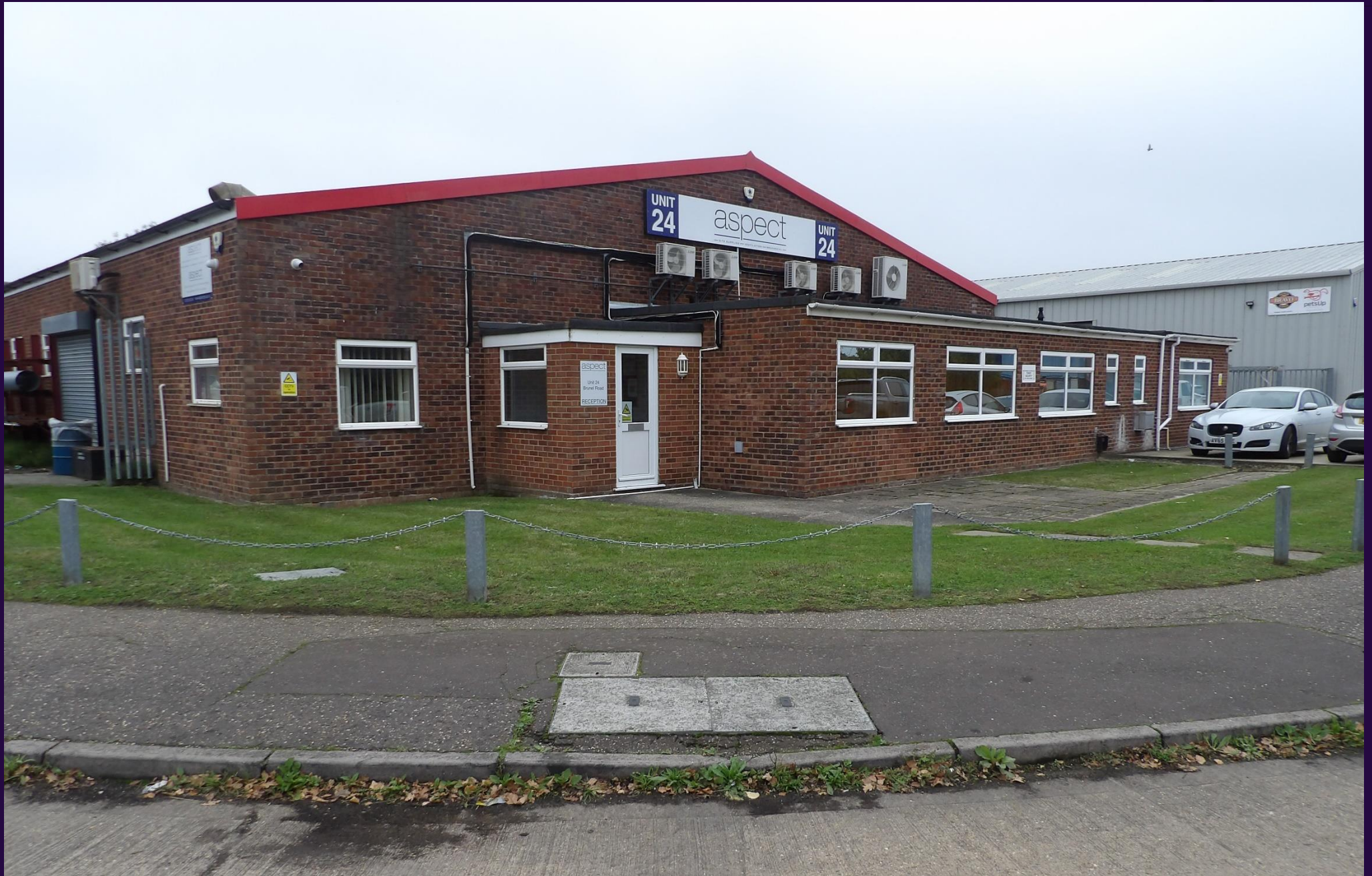
24 Brunel Road, Gorse Lane Industrial Estate, Clacton-on-Sea, Essex, CO15 4LU