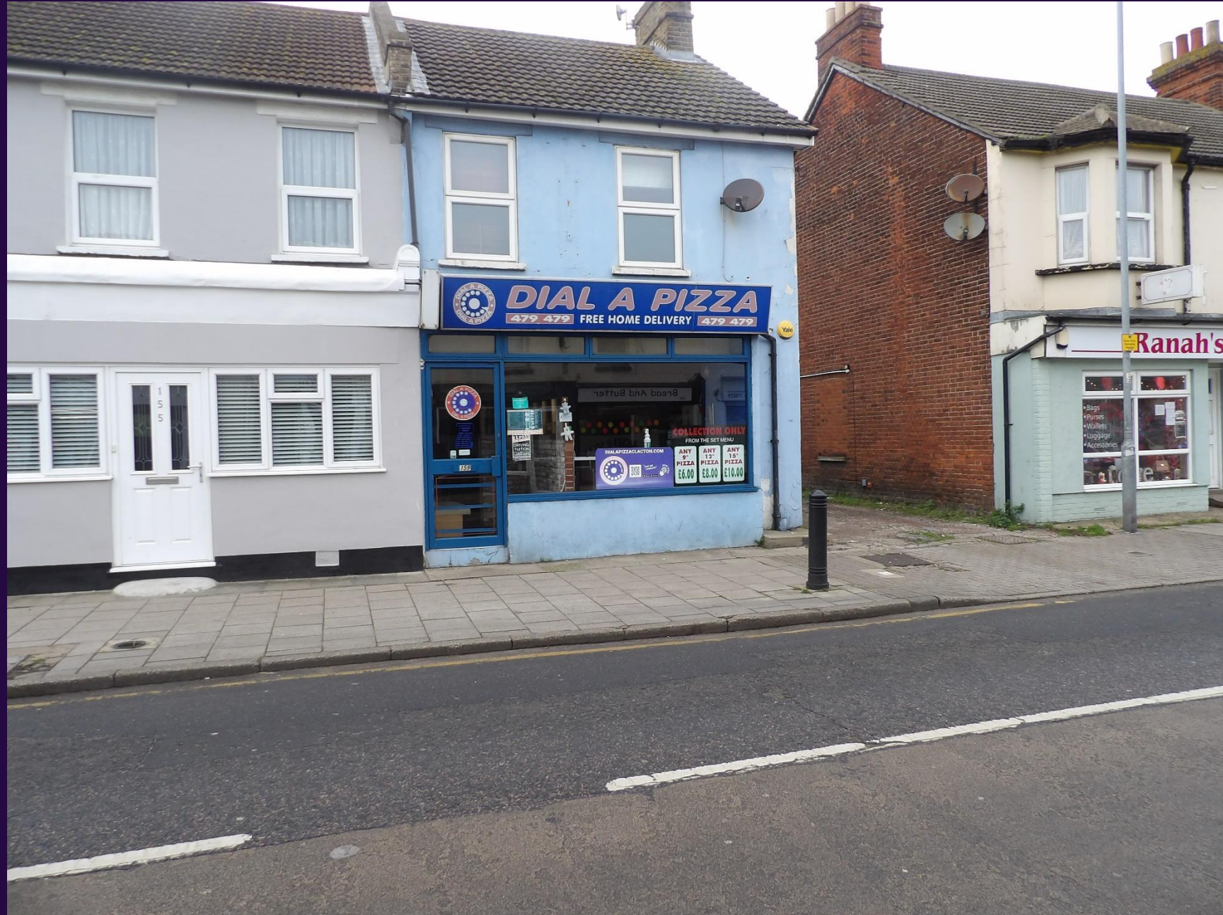
159 Old Road, Clacton on Sea, Essex, CO15 3AU