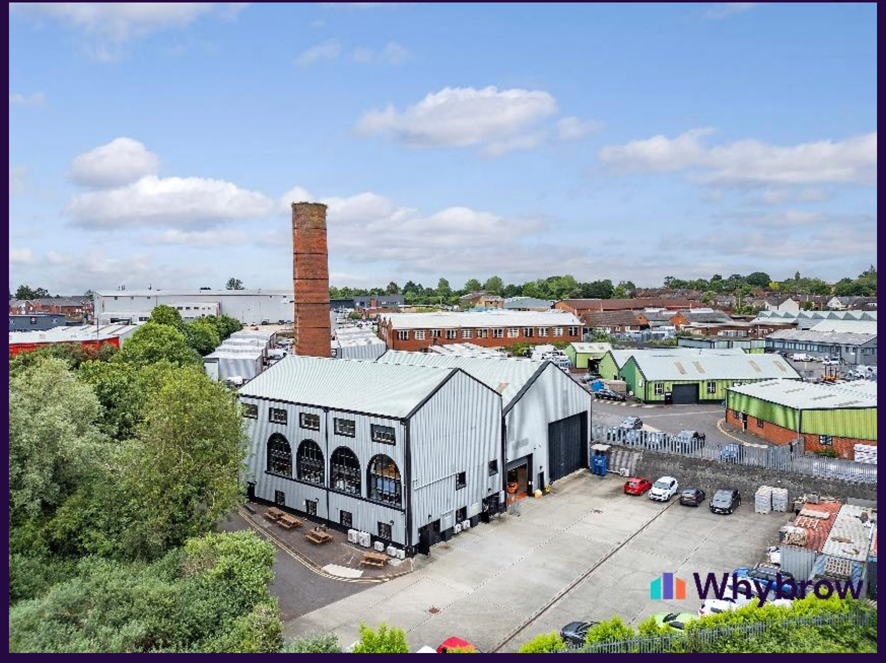
5C Enterprise Court, Lakes Road, Braintree, CM7 3QS